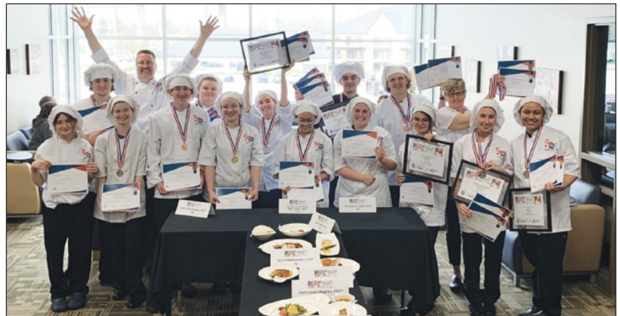
The Chippewa Valley and Dakota Culinary Team won big at their second ACF competition of the year at the Culinary Institute of Michigan.