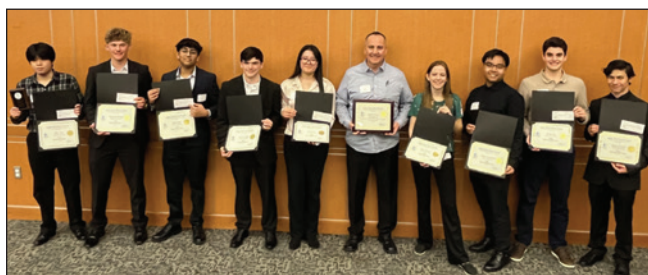
Dakota Design Technology students